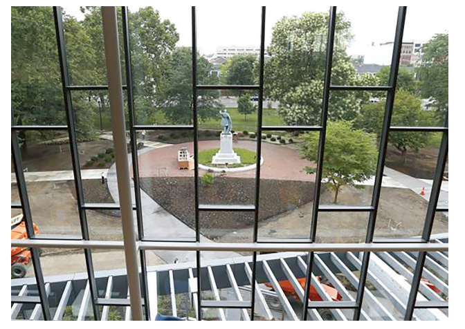
A view from the second floor as construction continues on the newest building, looking out at the 1910 statue of President McKinley.