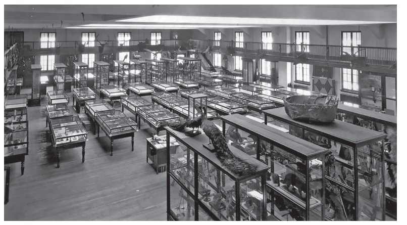
From 1893, the library's second floor offered a natural history museum. One of its more sensational artifacts was an Egyptian mummy and its sarcophagus.