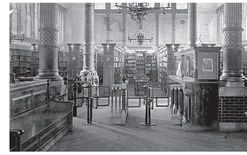
The columned interior of the original library, outfitted with black walnut shelves and tall windows through which light poured in.