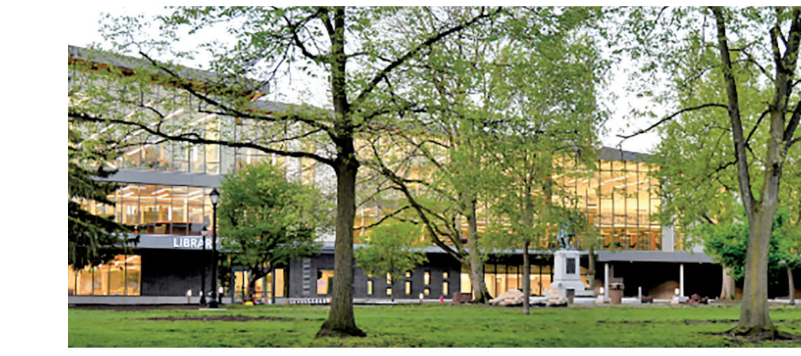
The library's sleek, glass-and-steel façade frames President McKinley in Cooper Park just as the original 1888 building did.

“ New library open for business today.... a first look at the new building is breathtaking. ”