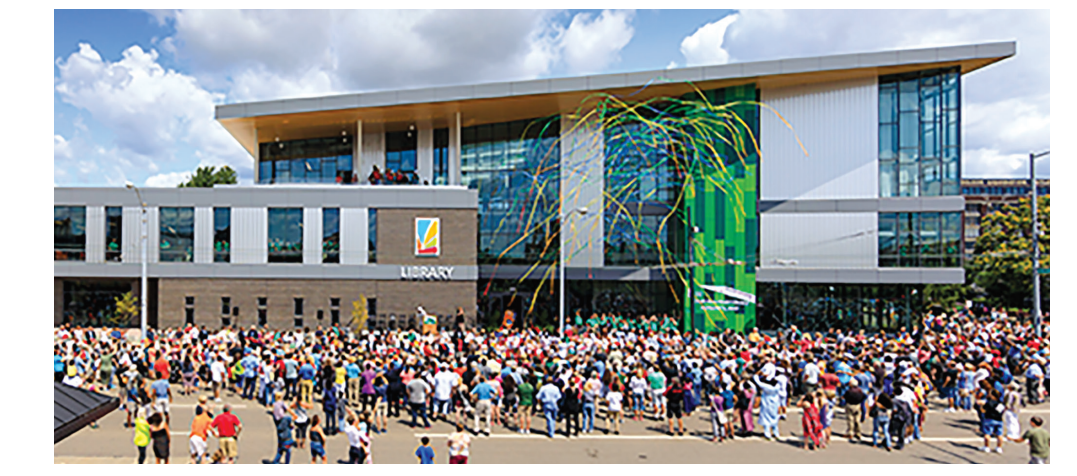
Fanfare during the grand opening ceremony of the newly-completed branch in August of 2017.