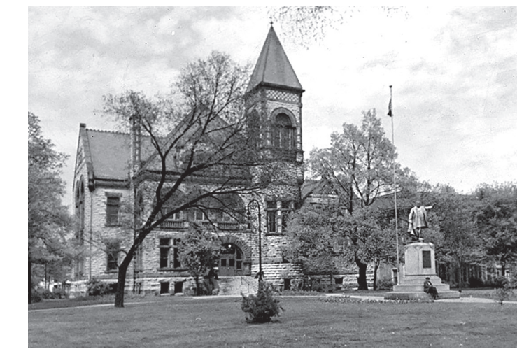
The Dayton library's first main branch, completed in 1888, in Cooper Park.