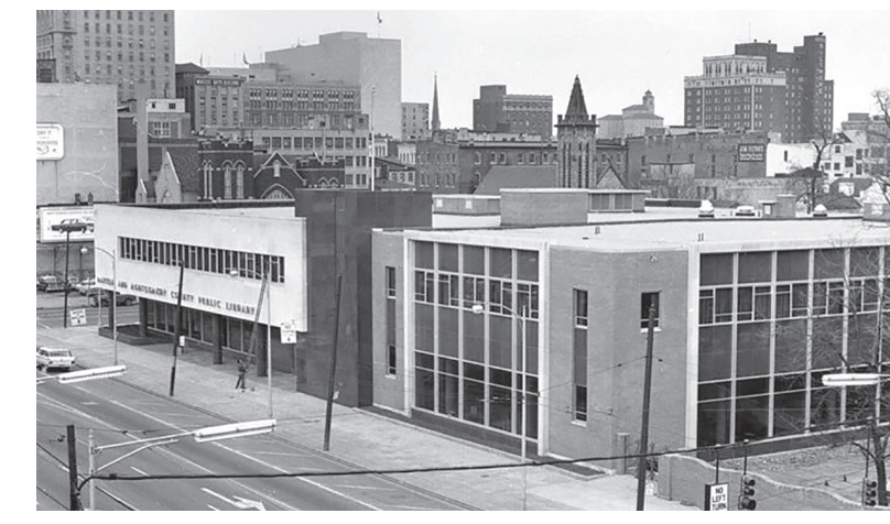
The 1888 building was demolished in 1960 to make way for a larger, modern-style branch on the same site. It is shown here shortly after its 1962 opening.