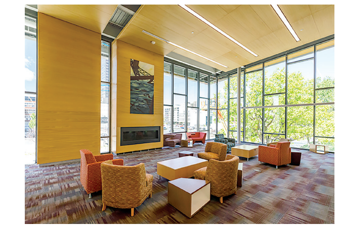
Among the many amenities of the new library, floor-to-ceiling windows and sitting areas with fireplaces vivify the reading spaces.