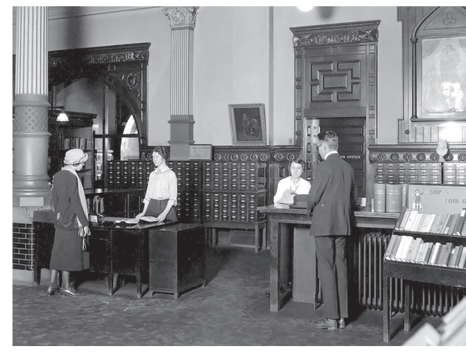
The reference desk in 1922.